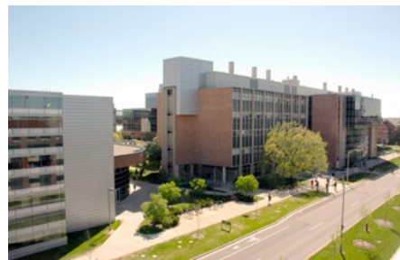
Figure 1: Example of a figure inclusion for a nuclear chemistry seminar abstract. Font for figure caption is 12 pt.

Treat the audience with respect by coming prepared and being enthusiastic about your subject. Teach your audience the material and answer their questions in a way that is neither trivial nor condescending. Face your audience when you speak. Observe the 45-50 minute time limit for the presentation so that you can allow 10 minutes for questions. Dress as you would if you were going to a job interview because, in each case, you are showcasing your abilities. When a question is asked, either by students or faculty, you should approach it not as a test but as an opportunity to share your knowledge and enthusiasm for your topic. We all learn something new from each seminar, and when you are talking, you are the teacher, the expert on the chosen topic. Teach your audience - professors and students.