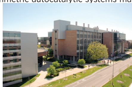
Figure 1: Example of a figure inclusion for a nuclear chemistry seminar abstract. Font for figure caption is 12 pt.

This seminar will cover the background of the general alkylation reactions by organozinc reagents and will introduce the search and the discovery of asymmetric autocatalytic systems.