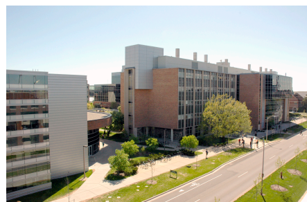
Figure 1: Example of a figure inclusion for a nuclear chemistry seminar abstract. Font for figure caption is 12 pt.

This seminar will cover the background of the general alkylation reactions by organozinc reagents and will introduce the search and the discovery of asymmetric autocatalytic systems.